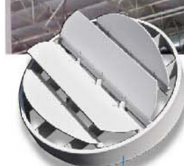
Model 881 Round Opposed Blade Damper