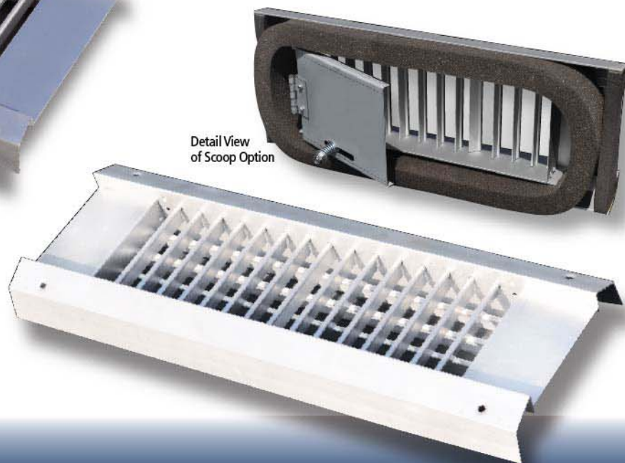
Detail View of Scoop Option