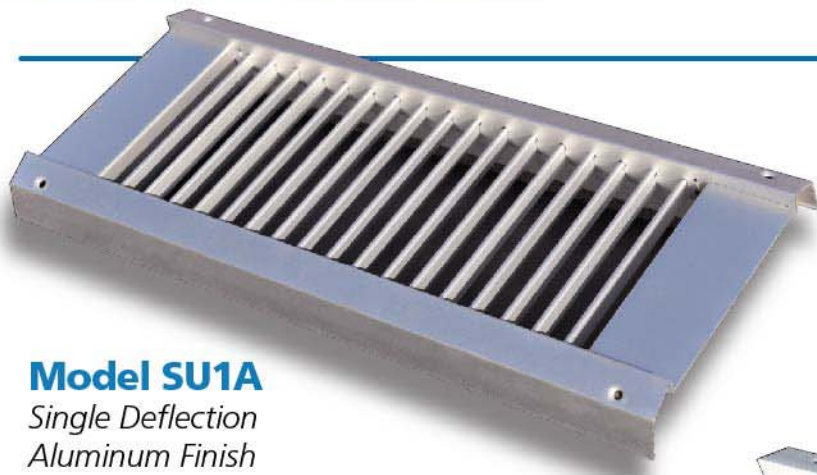
Model SU1A Single Deflection Aluminum Finish