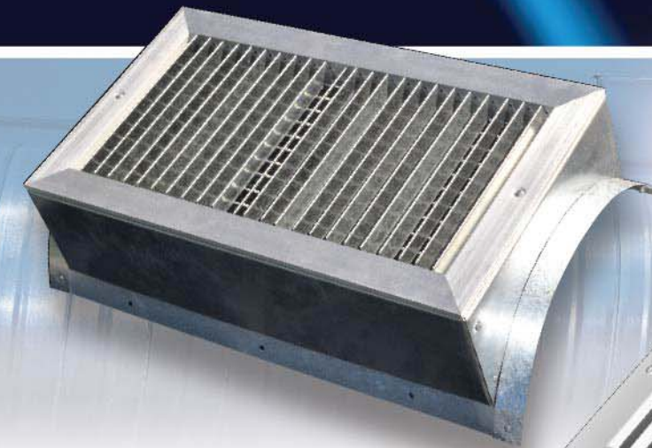
Model SD2A Saddle Type Double Deflection Aluminum Finish