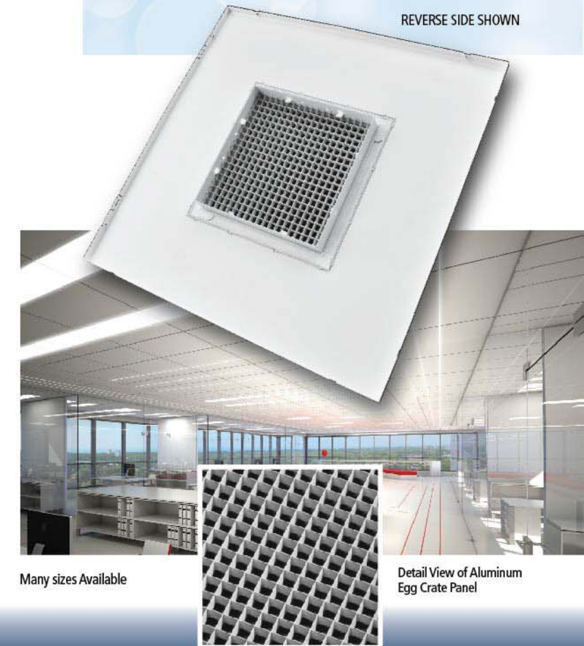
REVERSE SIDE SHOWN