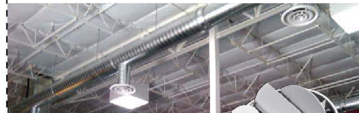
Model 883 Round Surface Mount Ring