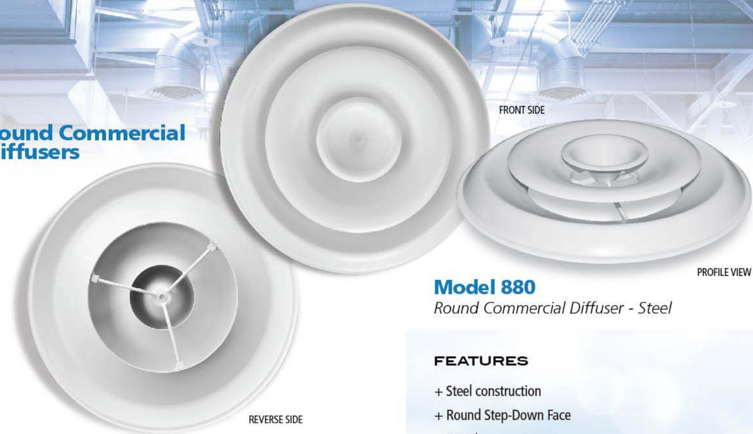
Model 880 Round Commercial Diffuser - Steel