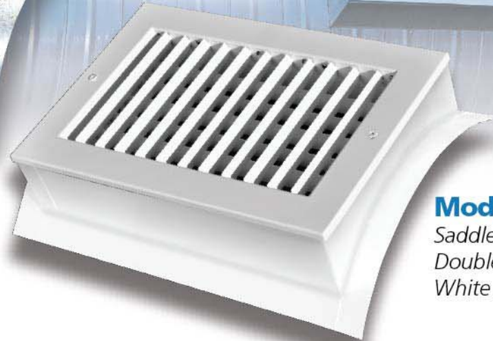
Model SD2W Saddle Type Double Deflection White Finish